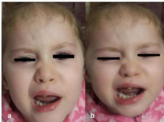
Figure 1. Facial nerve examination of a three-year-old girl: Left sided HB grade 3 peripheral facial nerve paralysis. a. Resting position, b. Disabled facial expression with effort.

plications. Ineffective examination of children or inappropriate medical treatments may hide the symptoms of complications. Intracranial complications such as meningitis, intracranial abscess, and otitic hydrocephalus can be mortal, whereas intratemporal complications such as mastoiditis, FNP, and labyrinthitis are more benign conditions [9]. Sudden onset of peripheral facial nerve paralysis may be the most dramatic complication for the patients and their families. Poor eyelid closure, disabled movement of mouth angle, and insignificant nasolabial sulcus are the most frightening symptoms for peripheral facial nerve paralysis (Figure 1). The paralysis grade can be progressive according to the facial nerve injury and severity.